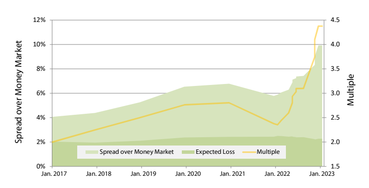
Figure 2: Spread of the cat bond market: Based on mid-spreads over MM-rate, various pricing sources, issue weighted, exclusion of «pathological» cases and short maturities (<1y, seasonality effects)

seen since the end of the credit crisis. As attractive as this sounds, the ILS market still stood in competition with other asset classes, of which the return expectations went up as well. It should be emphasised, though, that the ILS market achieved such yield increases without i) the massive devaluations seen on other assets and ii) the enhanced risks that hide in the unstable geopolitical situation and the general uncertainty of the economic environment which both have the potential of severely crashing the party in other asset classes.